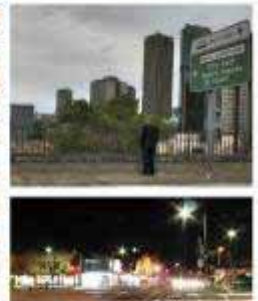
Ashwin Thomas "In Transit" sculptural installation [video and photography]