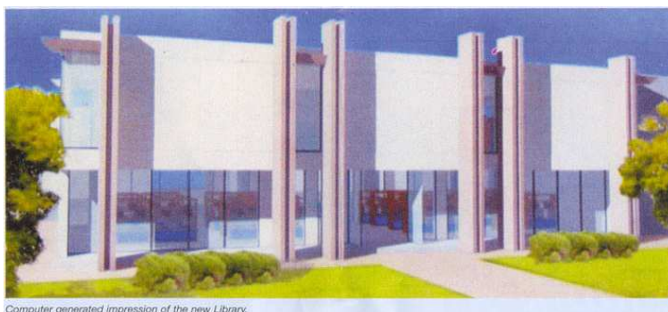
Computer generated impression of the new Library.

Sydney Boys High School depends upon its community of parents, Old Boys and supporters to further the School's ethos of the pursuit of all-round excellence.