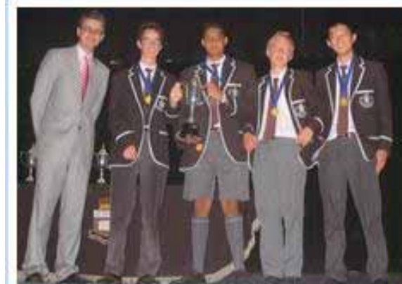
Victorious EDC Year 11 Team