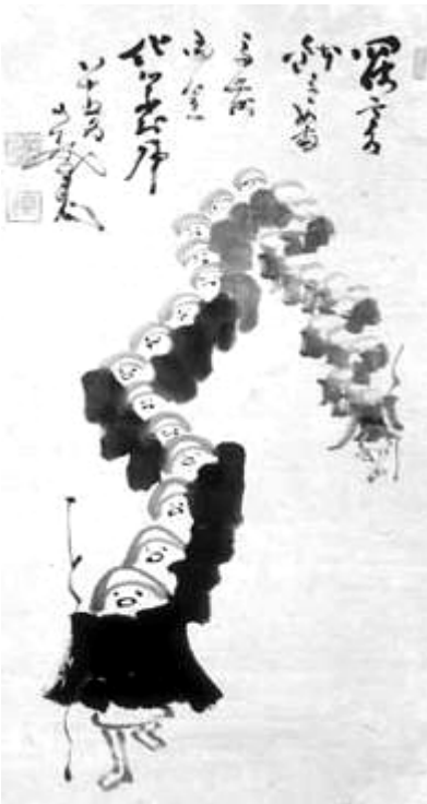
Nakahara Nantenbo Procession of begging monks (1923), hanging scroll, ink on paper

Sydney Boys High students and Families are encouraged to see this contemporary exhibition as it is a rare chance to see some of the world's most avant guard artists showcased in our city. Below are two of the upcoming works. ➤