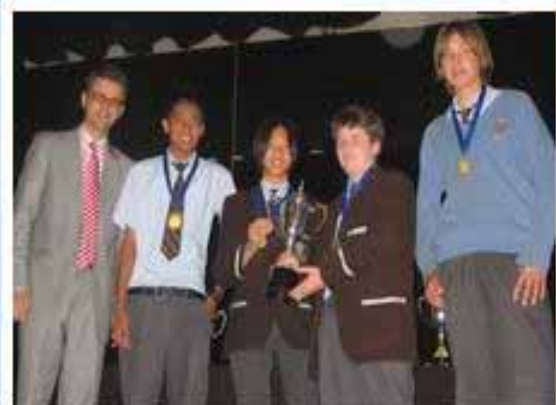
Victorious EDC Year 10 Team